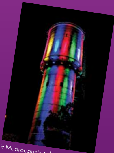
Visit Mooroopna's colourful water tower: McLennan Street