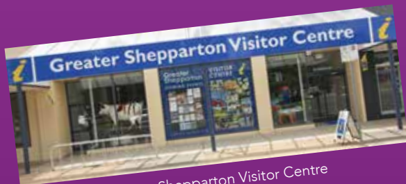
Greater Shepparton Visitor Centre 33 Nixon St, Shepparton