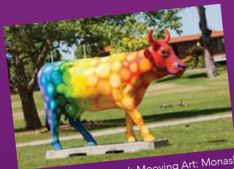
Check out Shepparton's Mooving Art: Monash Park, cnr. High & Fryers Sts